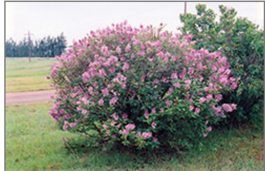
Miss Canada Lilac in bloom