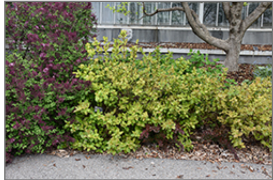
Wings Of Fire Weigela