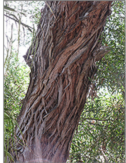
Narrow-Leaved Black Peppermint bark

This tree should only be grown in full sunlight. It does best in average to evenly moist conditions, but will not tolerate standing water. It is particular about its soil conditions, with a strong preference for sandy, acidic soils, and is able to handle environmental salt. It is somewhat tolerant of urban pollution. This species is not originally from North America.