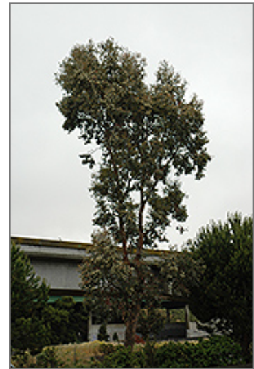
Narrow-Leaved Black Peppermint