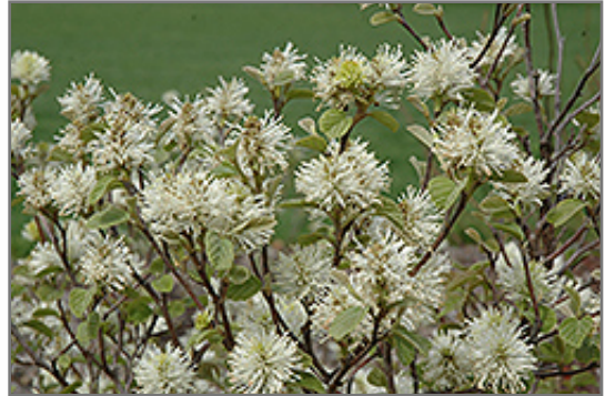
Dwarf Fothergilla flowers

This shrub does best in full sun to partial shade. It requires an evenly moist well-drained soil for optimal growth, but will die in standing water. It is not particular as to soil type, but has a definite preference for acidic soils, and is subject to chlorosis (yellowing) of the foliage in alkaline soils. It is somewhat tolerant of urban pollution. This species is native to parts of North America.