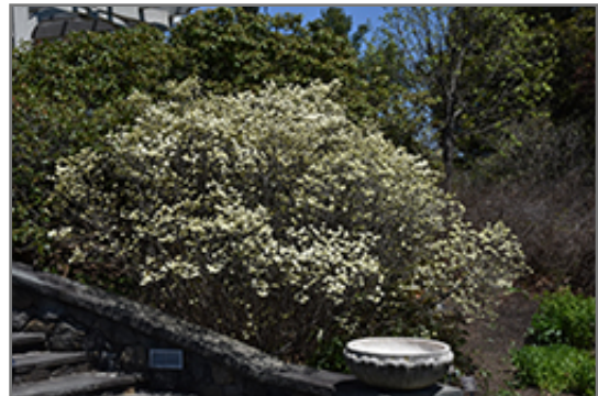
Dwarf Fothergilla in bloom

Dwarf Fothergilla is recommended for the following landscape applications;