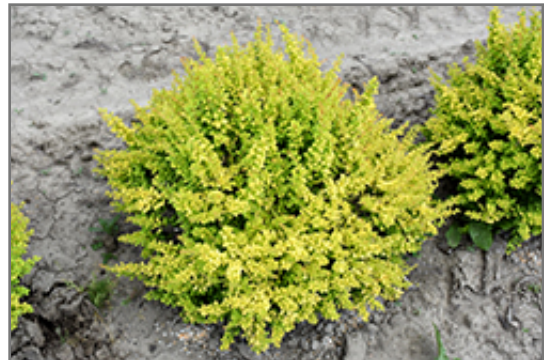
Sunsation Japanese Barberry

Sunsation Japanese Barberry is recommended for the following landscape applications;