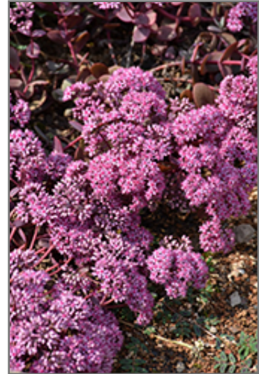
Cherry Tart Stonecrop flowers

Cherry Tart Stonecrop is a fine choice for the garden, but it is also a good selection for planting in outdoor pots and containers. It is often used as a 'filler' in the 'spiller-thriller-filler' container combination, providing a mass of flowers and foliage against which the larger thriller plants stand out. Note that when growing plants in outdoor containers and baskets, they may require more frequent waterings than they would in the yard or garden.