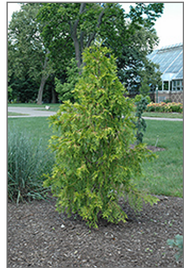
Canadian Gold Red Cedar