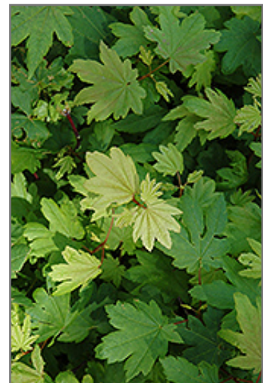
W.B. Hoyt Vine Maple foliage