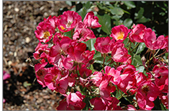
Miracle Sensation Rose flowers