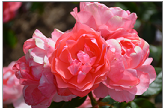
Passionate Kisses Rose flowers