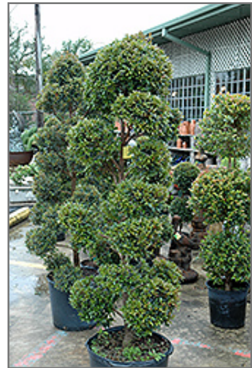
Brush Cherry