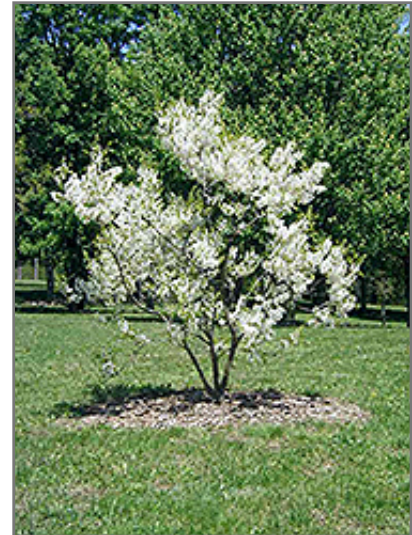
Yellowhorn in bloom