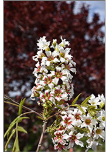
Yellowhorn flowers

This shrub should only be grown in full sunlight. It is very adaptable to both dry and moist locations, and should do just fine under average home landscape conditions. It is not particular as to soil type or pH. It is somewhat tolerant of urban pollution. This species is not originally from North America.