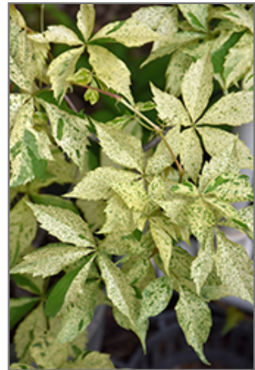
Star Showers Virginia Creeper foliage