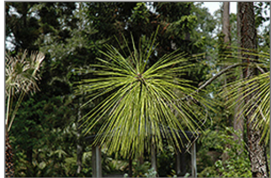
Longleaf Pine foliage