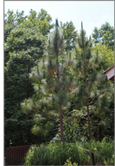
Longleaf Pine

This tree should only be grown in full sunlight. It prefers dry to average moisture levels with very well-drained soil, and will often die in standing water. It is not particular as to soil type or pH, and is able to handle environmental salt. It is quite intolerant of urban pollution, therefore inner city or urban streetside plantings are best avoided. This species is native to parts of North America.