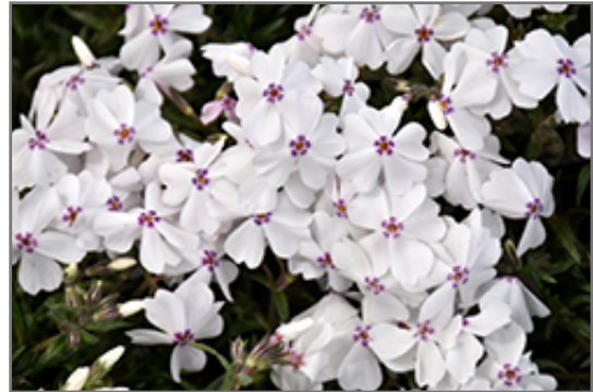
Amazing Grace Moss Phlox flowers