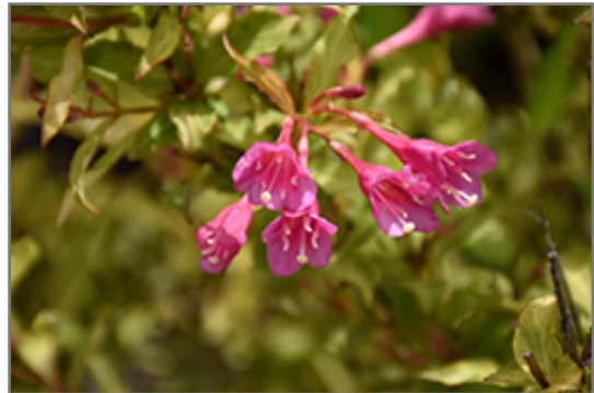
Colorstar Flamingo Pink Weigela flowers