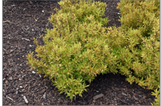
Colorstar Flamingo Pink Weigela

This shrub should only be grown in full sunlight. It prefers to grow in average to moist conditions, and shouldn't be allowed to dry out. It is not particular as to soil type or pH. It is highly tolerant of urban pollution and will even thrive in inner city environments. This is a selected variety of a species not originally from North America.