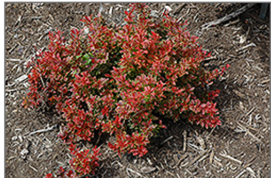
Lutin Rouge Japanese Barberry

Lutin Rouge Japanese Barberry is recommended for the following landscape applications;