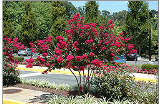
Cedar Lane Red Crape myrtle in bloom