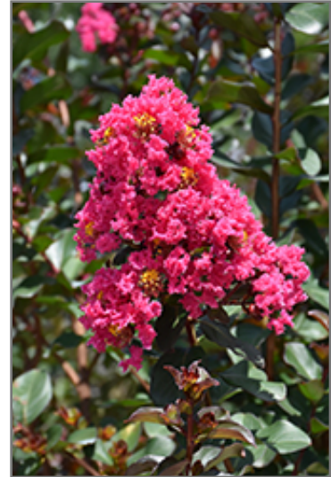
Pink Velour Crapemyrtle flowers