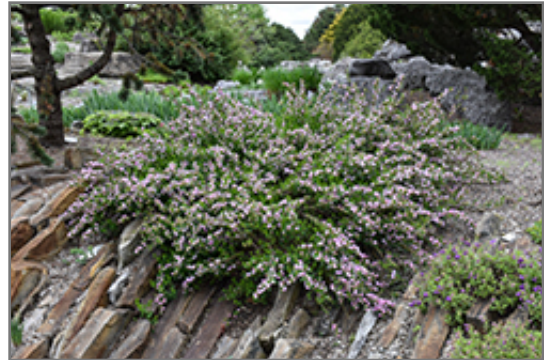
Purple Broom in bloom