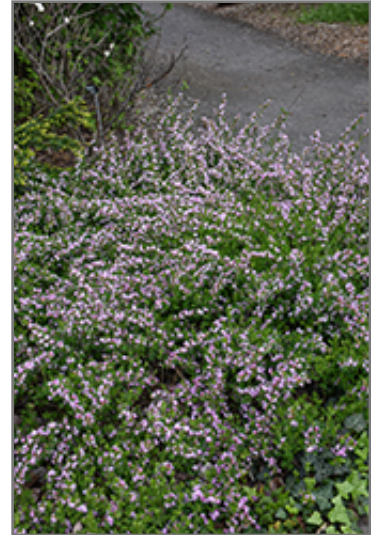
Purple Broom in bloom

This shrub should only be grown in full sunlight. It prefers dry to average moisture levels with very well-drained soil, and will often die in standing water. It is considered to be drought-tolerant, and thus makes an ideal choice for a low-water garden or xeriscape application. It is particular about its soil conditions, with a strong preference for clay, alkaline soils, and is able to handle environmental salt. It is highly tolerant of urban pollution and will even thrive in inner city environments. This species is not originally from North America.