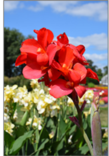
Cannova Bronze Scarlet Canna flowers

Cannova Bronze Scarlet Canna is a fine choice for the garden, but it is also a good selection for planting in outdoor pots and containers. With its upright habit of growth, it is best suited for use as a 'thriller' in the 'spiller-thriller-filler' container combination; plant it near the center of the pot, surrounded by smaller plants and those that spill over the edges. It is even sizeable enough that it can be grown alone in a suitable container. Note that when growing plants in outdoor containers and baskets, they may require more frequent waterings than they would in the yard or garden.