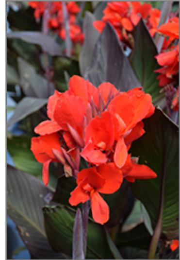
Cannova Bronze Scarlet Canna flowers

This plant is native to the tropics and prefers growing in moist environments with evenly warm conditions all year round. In our climate, it is usually grown as an outdoor annual in the garden or in a container. If you want it to survive the winter, it can be brought in to the house and provided with special care, and then returned to the garden the following season. In its preferred tropical habitat, it can grow to be around 4 feet tall at maturity, with a spread of 20 inches. However, when grown as an annual or when overwintered indoors, it can be expected to perform differently, and its exact height and spread will depend on many factors; you may wish to consult with our experts as to how it might perform in your specific application and growing conditions.