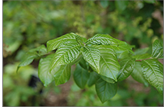
Aurea Orixia foliage