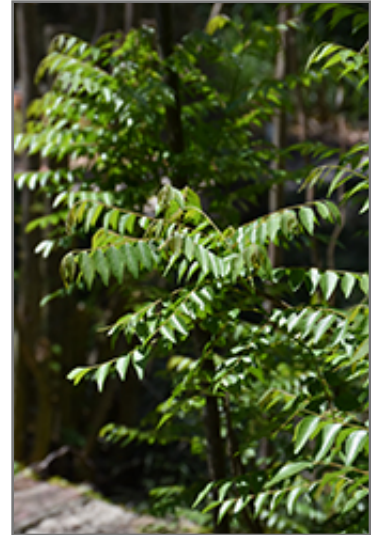
Curry Tree foliage