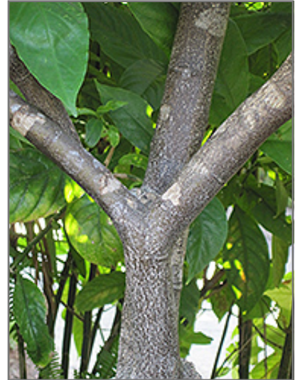
Curry Tree bark

This tree does best in full sun to partial shade. It prefers to grow in average to moist conditions, and shouldn't be allowed to dry out. It is not particular as to soil type or pH. It is somewhat tolerant of urban pollution. This species is not originally from North America.