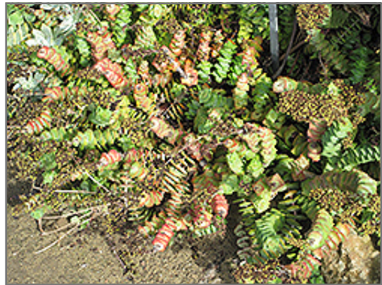
String Of Buttons

String Of Buttons is recommended for the following landscape applications;