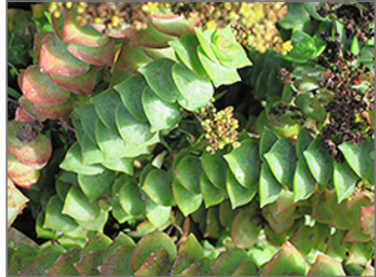
String Of Buttons foliage

String Of Buttons is recommended for the following landscape applications;