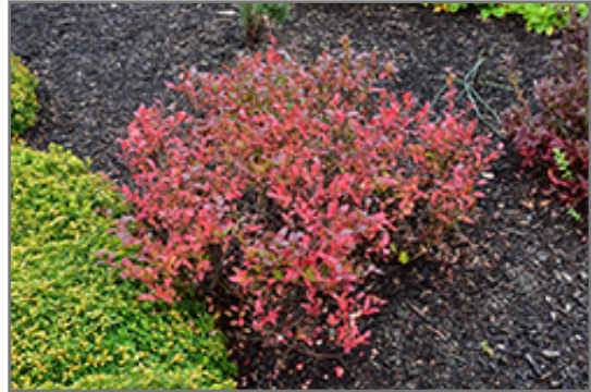
Lowbush Blueberry in fall

This shrub is typically grown in a designated area of the yard because of its mature size and spread. It performs well in both full sun and full shade. It does best in average to evenly moist conditions, but will not tolerate standing water. It is very fussy about its soil conditions and must have sandy, acidic soils to ensure success, and is subject to chlorosis (yellowing) of the foliage in alkaline soils. It is quite intolerant of urban pollution, therefore inner city or urban streetside plantings are best avoided, and will benefit from being planted in a relatively sheltered location. Consider applying a thick mulch around the root zone in winter to protect it in exposed locations or colder microclimates. This species is native to parts of North America.