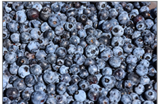
Lowbush Blueberry fruit

Lowbush Blueberry features dainty clusters of white bell-shaped flowers with shell pink overtones hanging below the branches in mid spring. It has dark green deciduous foliage. The oval leaves turn an outstanding scarlet in the fall. It features an abundance of magnificent blue berries in mid summer.