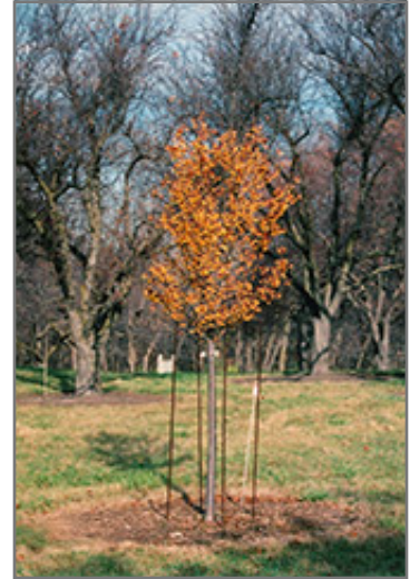
Lancelot Flowering Crab fruit

This shrub should only be grown in full sunlight. It prefers to grow in average to moist conditions, and shouldn't be allowed to dry out. It is not particular as to soil type or pH. It is highly tolerant of urban pollution and will even thrive in inner city environments. This particular variety is an interspecific hybrid.