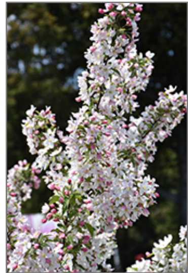
Lancelot Flowering Crab flowers