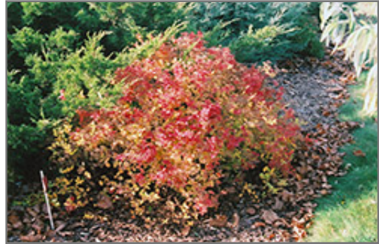
Golden Princess Spirea in fall