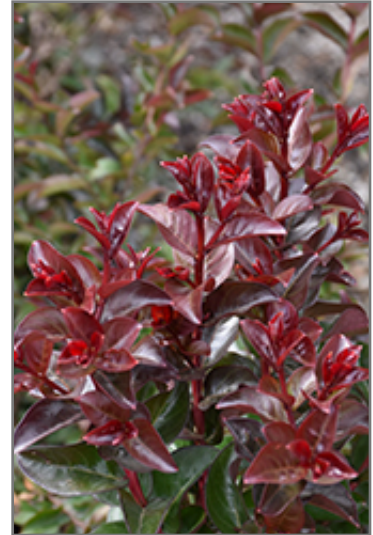
Cherry Mocha Crapemyrtle foliage

Cherry Mocha Crapemyrtle makes a fine choice for the outdoor landscape, but it is also well-suited for use in outdoor pots and containers. With its upright habit of growth, it is best suited for use as a 'thriller' in the 'spiller-thriller-filler' container combination; plant it near the center of the pot, surrounded by smaller plants and those that spill over the edges. It is even sizeable enough that it can be grown alone in a suitable container. Note that when grown in a container, it may not perform exactly as indicated on the tag - this is to be expected. Also note that when growing plants in outdoor containers and baskets, they may require more frequent waterings than they would in the yard or garden.