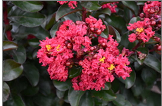
Cherry Mocha Crapemyrtle flowers

Cherry Mocha Crapemyrtle is recommended for the following landscape applications;