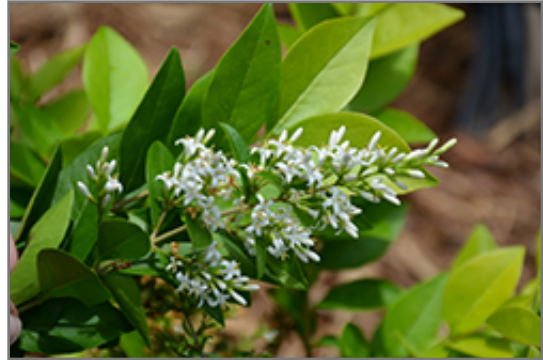
Golden Ticket Privet flowers

This shrub should only be grown in full sunlight. It is very adaptable to both dry and moist locations, and should do just fine under average home landscape conditions. It is not particular as to soil type or pH, and is able to handle environmental salt. It is highly tolerant of urban pollution and will even thrive in inner city environments. This particular variety is an interspecific hybrid.