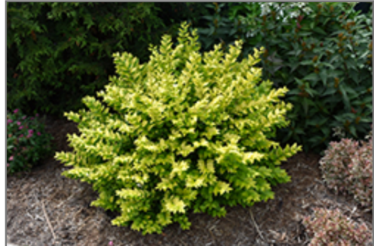
Golden Ticket Privet