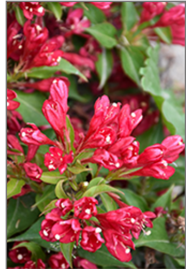
Crimson Kisses Weigela flowers