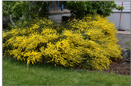
Spanish Gold Broom in bloom