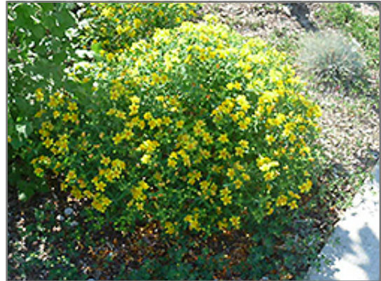
Kalm's St. John's Wort in bloom