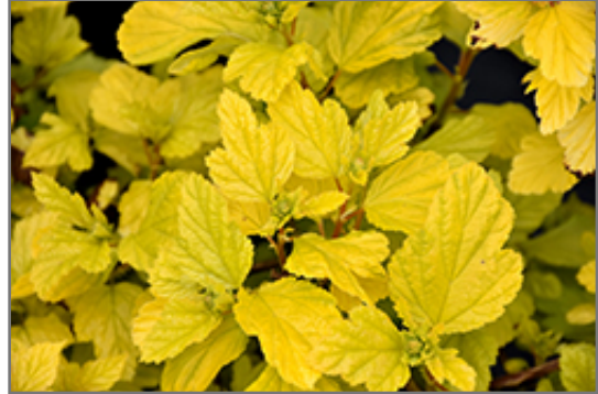
Festivus Gold Ninebark foliage

This shrub does best in full sun to partial shade. It is very adaptable to both dry and moist locations, and should do just fine under average home landscape conditions. It is not particular as to soil type or pH. It is highly tolerant of urban pollution and will even thrive in inner city environments. This is a selection of a native North American species.