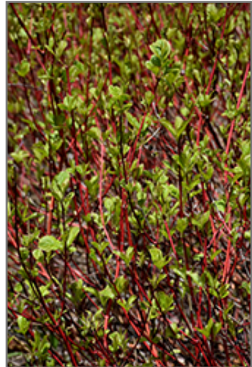
Westonbirt Dogwood stems