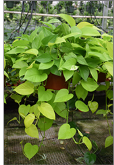
Neon Pothos in full

When grown indoors, Neon Pothos can be expected to grow to be about 5 feet tall at maturity, with a spread of 24 inches. It grows at a fast rate, and under ideal conditions can be expected to live for approximately 10 years. This houseplant performs well in both bright or indirect sunlight and strong artificial light, and can therefore be situated in almost any well-lit room or location. It does best in average to evenly moist soil, but will not tolerate standing water. The surface of the soil shouldn't be allowed to dry out completely, and so you should expect to water this plant once and possibly even twice each week. Be aware that your particular watering schedule may vary depending on its location in the room, the pot size, plant size and other conditions; if in doubt, ask one of our experts in the store for advice. It is not particular as to soil type or pH; an average potting soil should work just fine. Be warned that parts of this plant are known to be toxic to humans and animals, so special care should be exercised if growing it around children and pets.