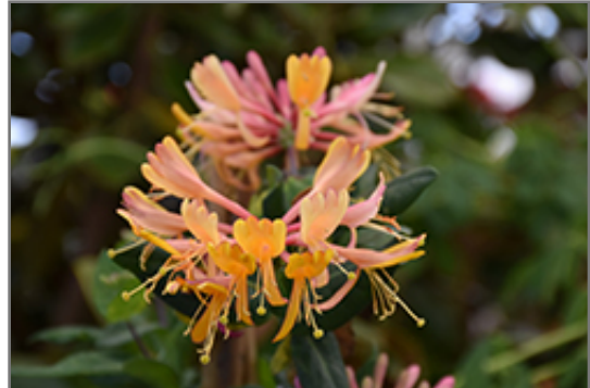
Goldflame Honeysuckle flowers