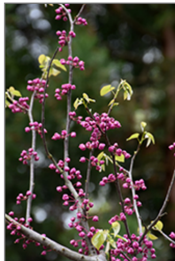
Pink Pom Poms Redbud flowers