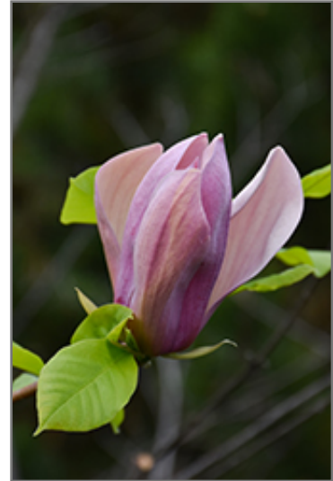
Eva Maria Magnolia flowers