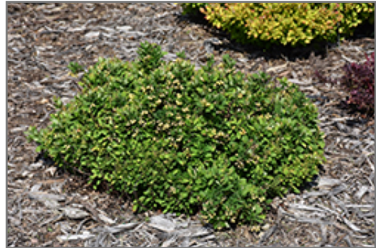
Moscato Barberry