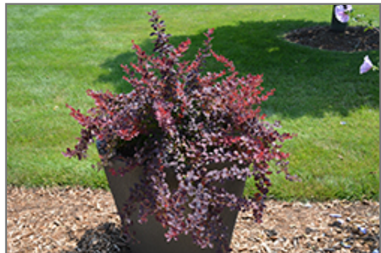
Sunjoy Syrah Japanese Barberry in bloom