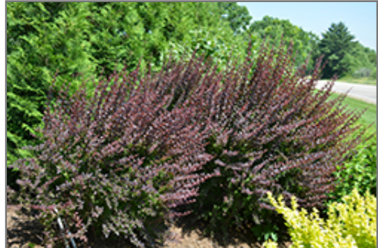
Sunjoy Syrah Japanese Barberry

Sunjoy Syrah Japanese Barberry is recommended for the following landscape applications;