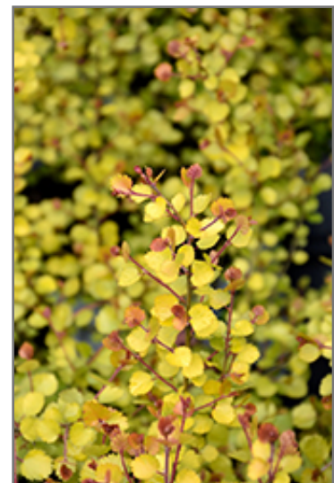
Cesky Gold Dwarf Birch foliage