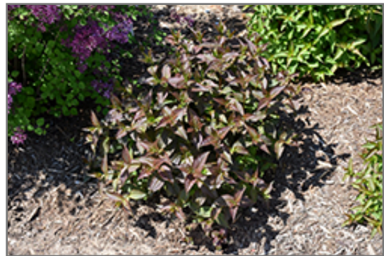
Kodiak Black Diervilla