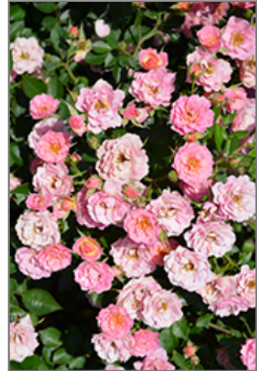
Oso Easy Petit Pink flowers