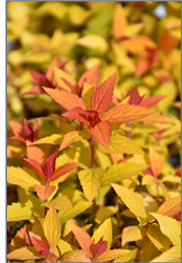
Double Play Candy Corn Spirea foliage

Double Play Candy Corn Spirea is recommended for the following landscape applications;