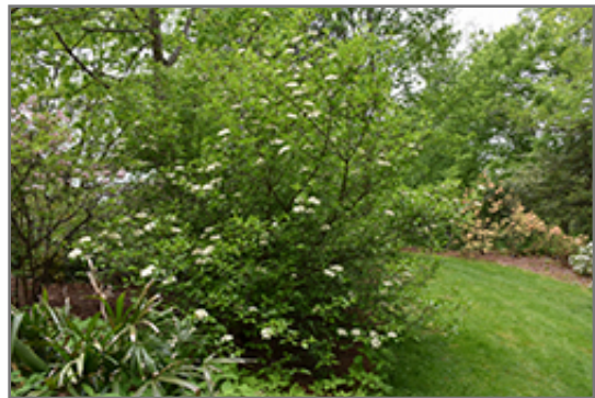
Emerald Charm Rusty Blackhaw in bloom