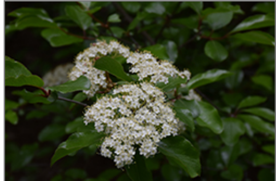
Emerald Charm Rusty Blackhaw flowers

Emerald Charm Rusty Blackhaw is a multi-stemmed deciduous shrub with an upright spreading habit of growth. Its relatively coarse texture can be used to stand it apart from other landscape plants with finer foliage.