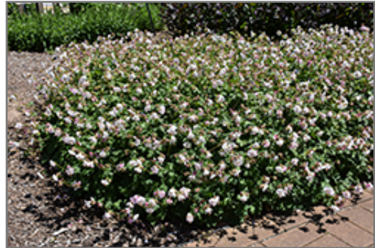
Biokovo Cranesbill in bloom