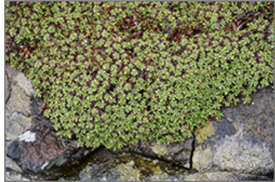
Cushion Bolax

Cushion Bolax is recommended for the following landscape applications;