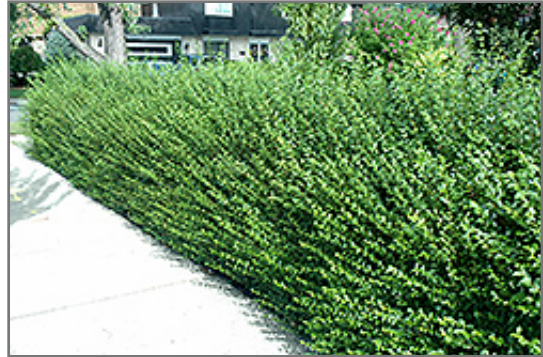
Amur Privet

Amur Privet will grow to be about 12 feet tall at maturity, with a spread of 8 feet. It tends to be a little leggy, with a typical clearance of 2 feet from the ground, and is suitable for planting under power lines. It grows at a fast rate, and under ideal conditions can be expected to live for approximately 30 years.