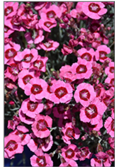
Star Single Peppermint Star Pinks flowers

This is a relatively low maintenance plant, and is best cleaned up in early spring before it resumes active growth for the season. It is a good choice for attracting bees and butterflies to your yard, but is not particularly attractive to deer who tend to leave it alone in favor of tastier treats. It has no significant negative characteristics.