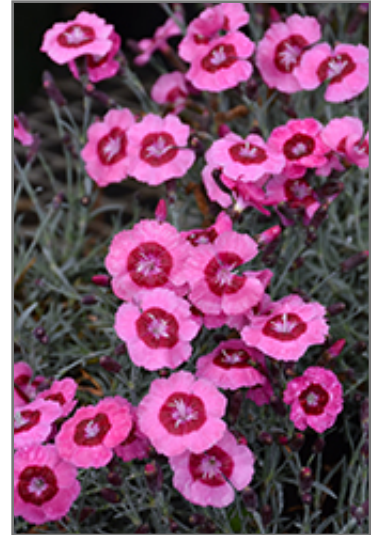
Star Single Peppermint Star Pinks flowers

Star Single Peppermint Star Pinks will grow to be only 6 inches tall at maturity extending to 8 inches tall with the flowers, with a spread of 12 inches. When grown in masses or used as a bedding plant, individual plants should be spaced approximately 8 inches apart. Its foliage tends to remain low and dense right to the ground. It grows at a medium rate, and under ideal conditions can be expected to live for approximately 10 years. As an evergreen perennial, this plant will typically keep its form and foliage year-round.