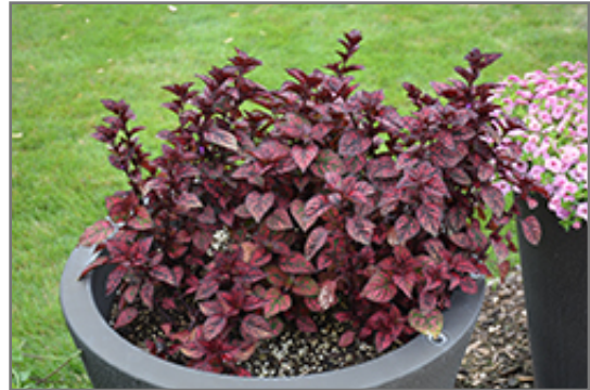
Hippo Red Polka Dot Plant